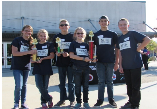
Pictured left to right:

Mountain Home School participated in the Madera County Math Tournament on Friday, November 6 th . There were 19 math teams that competed in the event. Our team placed 1 st in the relay race, 3 rd in circuit training, and 2 nd overall. We are so proud of everyone! Congratulations!