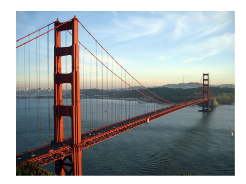
Field Trip to the Academy of Arts & Science

Great Job Students! We are proud of all of you. AcaDec topic & study material will be sent to us sometime in April to get ready for the 2020-21 School Year.